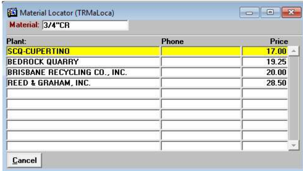
Figure 2. Material Locator Screen

This screen allows you to select a material and then see the Plants that carry the item. The results are ordered by the lowest price.